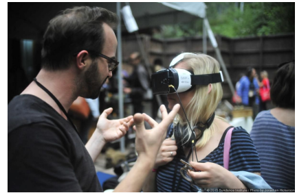
(L-R) Creative Producing Summit 2015 ; Creative Producing Labs 2015 ; Creative Producing Summit 2015

Los Angeles, CA — Sundance Institute today announced the participants for its weeklong Creative Film Producing Initiative at the Sundance Resort in Utah, August 1-8, including eleven feature film and documentary projects for the Creative Producing Labs , and more than 50 industry leaders for the Creative Producing Summit . The Institute's Creative Producing Initiative encompasses a year-round series of Labs, Fellowships, granting and events focusing on nurturing the next generation of independent producers and renewing the community of veteran producers who sustain the vibrancy and vitality of independent film.