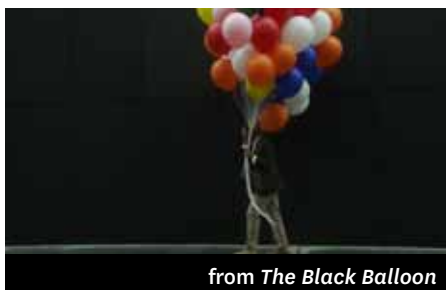
from The Black Balloon