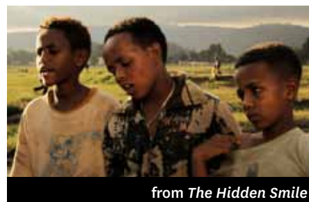
from The Hidden Smile