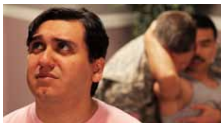
from FOURPLAY: TAMPA