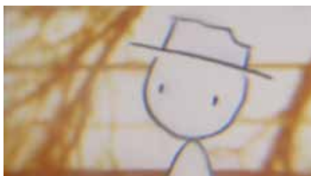
from It's Such a Beautiful Day