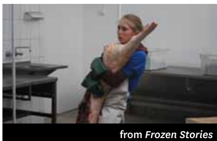
from Frozen Stories