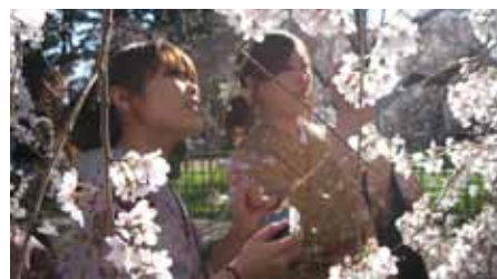
from The Tsunami and the Cherry Blossom